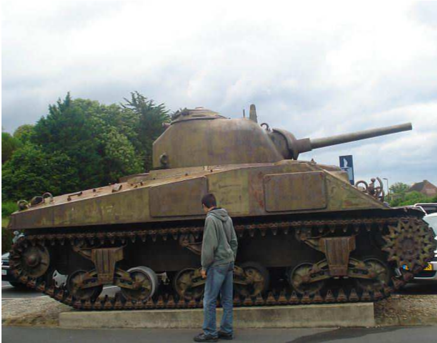
Char Sherman M4 di Omaha Beach.